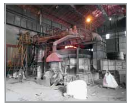
Preparation of the molten metal, e.g. in a 50-ton furnace. The temperature is measured through the slag opening. The casting temperature is reached at 1650 °C.