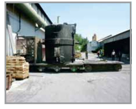
Transporting the casting ladle to the molding shop to pour off the material.