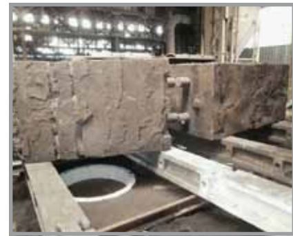
The prepared mold in the pit.