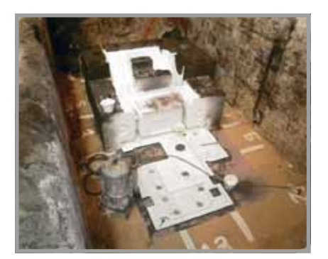
The mold is created. (molding)