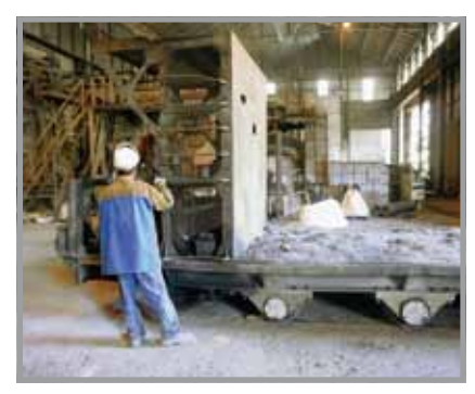
The rail transport of the casting ladles is prepared.