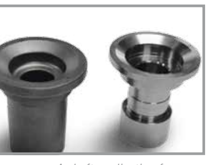
A shaft application for a transmission produced on the new AMP 50.