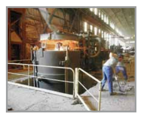
The casting ladles are prepared and heated up.