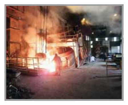
Exactly the same process is used with the second casting ladle, which is also moved into position next to the 35-ton furnace, and filled.