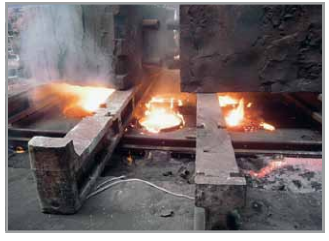
The cast now has to rest for two weeks in the earth until it has cooled down.