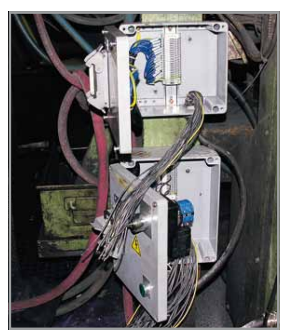
Installation of various new terminal boxes, incl. safety system.