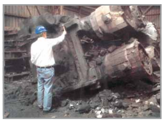
The excavated raw cast component

In mechanical processing, the feeder system is separated and the body is sand-blasted before being rough-machined and primed. Only then is the body ready for normal further processing to become the next Hatebur machine.