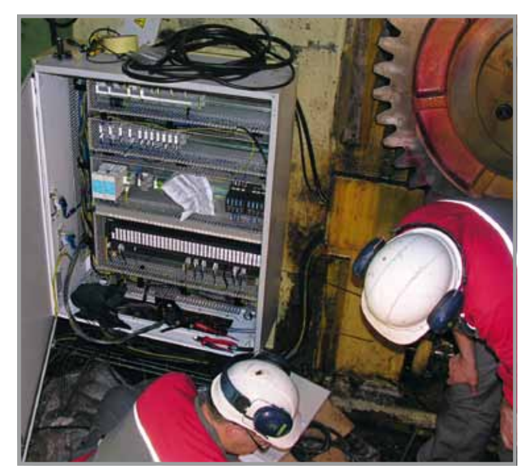
Installation and wiring on the main terminal box on the machine.