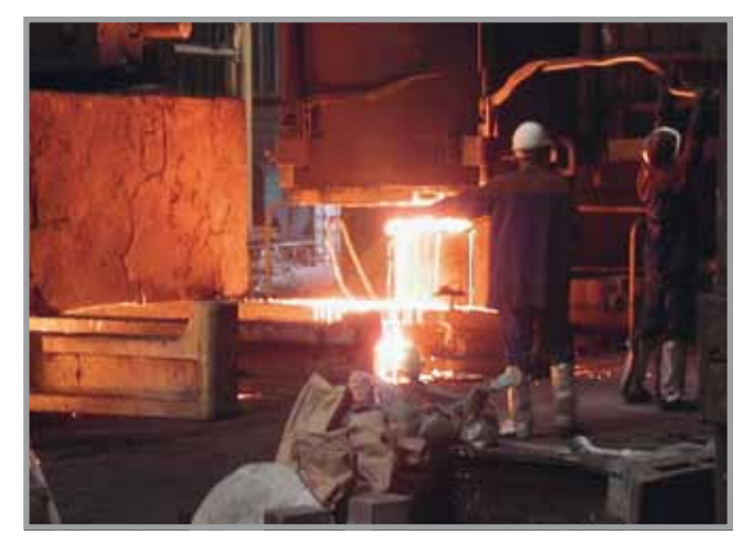
The casting process is completed.