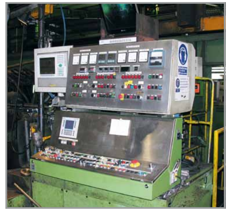
The newly positioned and installed control for the machine, the ESA600, press load monitor and the heating unit.