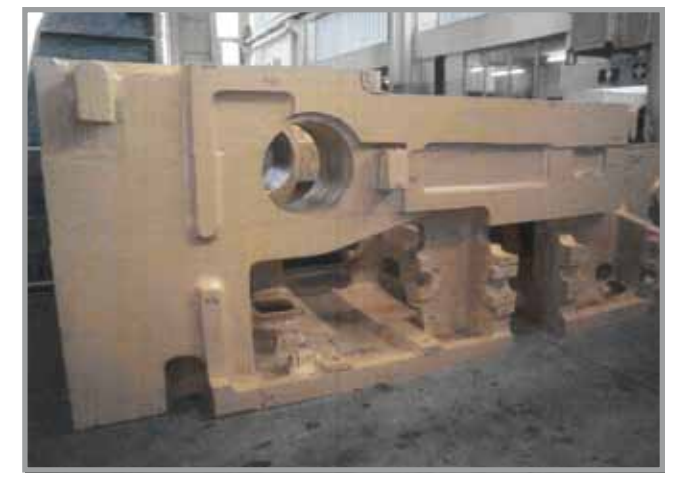
For further process steps, see the next issue of Netshape in mid 2013.

In mechanical processing, the feeder system is separated and the body is sand-blasted before being rough-machined and primed. Only then is the body ready for normal further processing to become the next Hatebur machine.