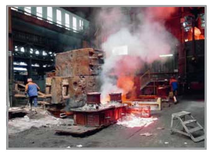
In less than ten minutes, 85 tons of liquid steel have disappeared into the earth.